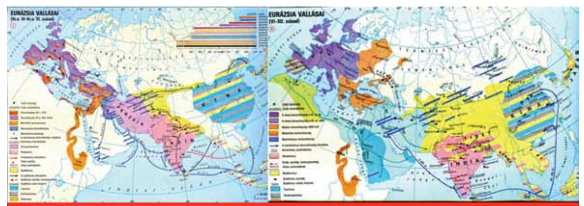
How the region of Eurasian nature religion-shamanism, marked with white, shrank between 600 A.D. and 1200 A.D. This is the only region on the map the age of which is not indicated. The reason is that this is the region of the ancient religion of mankind, more precisely, of its ancient philosophy, as philosophy, science and religion were not separated in that civilisation. We should remember that Chinese Confucianism and Buddhism have been built on this ancient philosophical system and can be regarded as its continuation. If we would track down the shrinking of the region of the ancient nature religion further in time towards today, present-day China, Japan (Shintoism) and South-East Asia would remain. Our civilizational self-identity linked the Carpathian Basin with Southeast Asia for thousands of years. Exploring this common, ancient Eurasian civilisation might have a significant role in building the New Silk Road together, recognising our shared civilisational self-identity, reconnecting people sharing the same traditions.

of nature governing matter, life and mind connect man with the whole of the Universe, the exploration of these laws connects human life and the human mind with the life and mind of the Universe. The philosophical system of ancient Eurasia is the formulation of the cosmic basic principles of matter, life and mind, and their harmony. Since these three cosmic basic principles constitute and govern the Universe, and the Universe, ultimately, is a uniform whole, the One itself, on a cosmic level, matter, life and mind are necessarily in harmony. In this cosmic triumvirate, the material world is governed by life and mind. Life adds the ultimate value, and mind provides life with the most advantageous decision (Grandpierre, A. Soul and Universe (Lélek és Világegyetem), 2016).